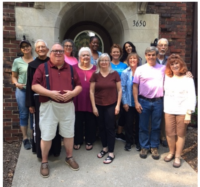
Silva Graduates, Summer 2021